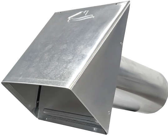
PN 12550 with tail