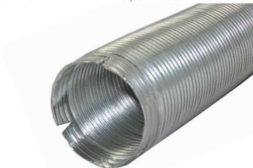
READI-PIPE™ V450-TD SOFT CUFF ENDS