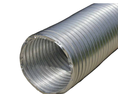
V250-TD PLAIN ENDS