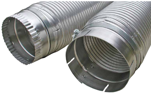
BUILDER'S BEST® V850-TD SNAP-LOCK™