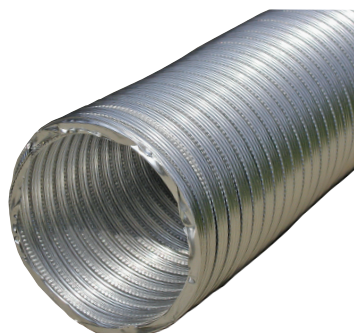
V250-TD PLAIN ENDS