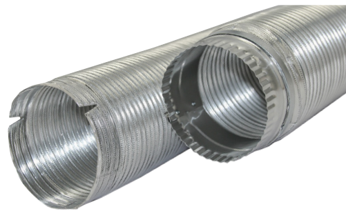
E-Z-FASTEN™ V550-TD ONE CRIMPED FITTING, ONE SOFT CUFF END