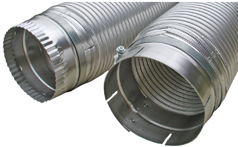
BUILDER'S BEST® V850-TD SNAP-LOCK™