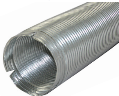
READI-PIPE™ V450-TD SOFT CUFF BOTH ENDS