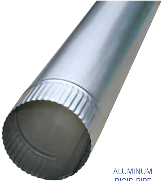
ALUMINUM RIGID PIPE