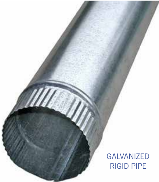
GALVANIZED RIGID PIPE

Galvanized 30 gauge and V030 aluminum (26 gauge) meet most building codes for in-wall use.