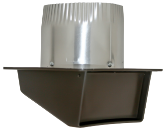
WITH 3" RIGID ALUMINUM TAIL CRIMPED