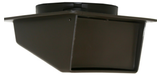
WITH CONNECTING RING