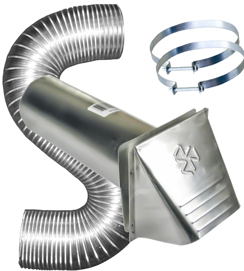
12101, 10536, 10537