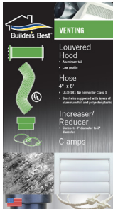
11520 DISPLAY BOX