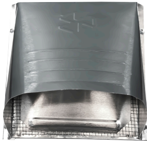
12549 1/8" X 1/8" SCREEN

Only models without screens should be considered for clothes dryer venting. Check your local building codes and appliance manufacturer instructions.